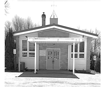
St. John the Baptist Church Port Severn