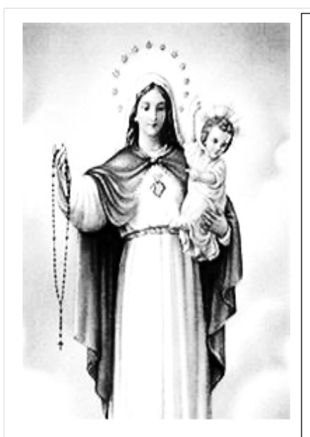
Our Lady of Mercy Pray for Us