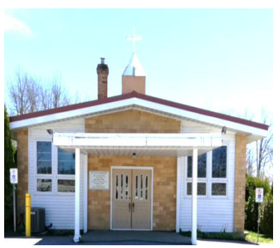
St. John the Baptist Church Port Severn