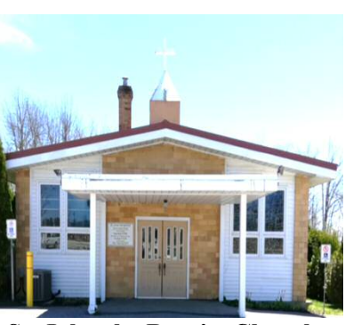
St. John the Baptist Church Port Severn