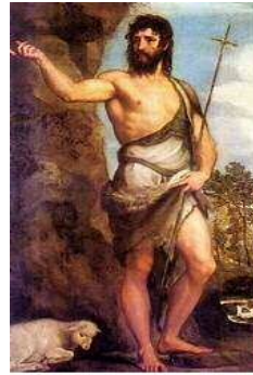
St. John the Baptist Pray for Us