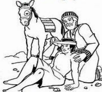
The Good Samaritan

"But the Samaritan was moved with pity."