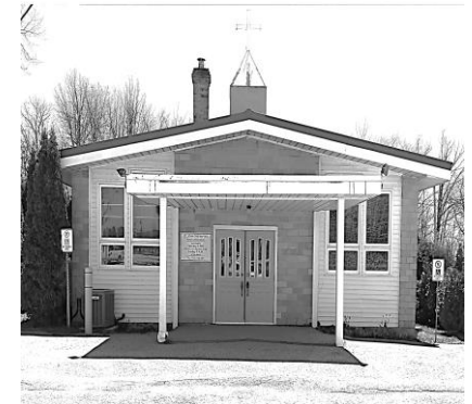
St. John the Baptist Church