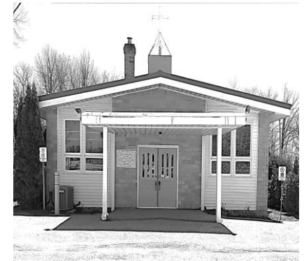
St. John the Baptist Church