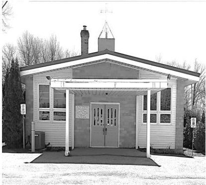
St. John the Baptist Church

Address: Our Lady of Mercy Parish P.O. Box 126 2596 Honey Harbour Rd. Honey Harbour, On P0E1E0