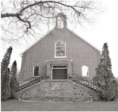
Our Lady of Mercy Church

I have certain recourse rights if any debit does not comply with this agreement. For example, I have the right to receive reimbursement for any debit that is not authorized or is not consistent with this PAD agreement. To obtain more information on my recourse rights, I may contact my financial institution or visit www.cdnpay.ca I may revoke my authorization at any time, subject to providing notice of 30 days. To obtain a sample cancellation form or for more information on my right to cancel a PAD Agreement, I may contact my financial institution or visit www.cdnpay.ca