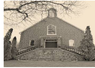
Our Lady of Mercy Church Honey Harbour