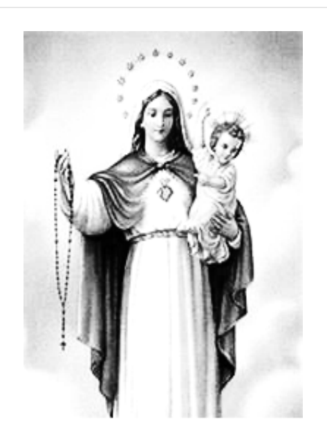
Our Lady of Mercy Pray for Us