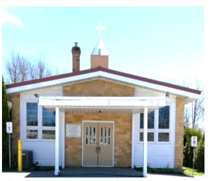
St. John the Baptist Church Port Severn