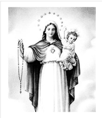
Our Lady of Mercy Pray for Us