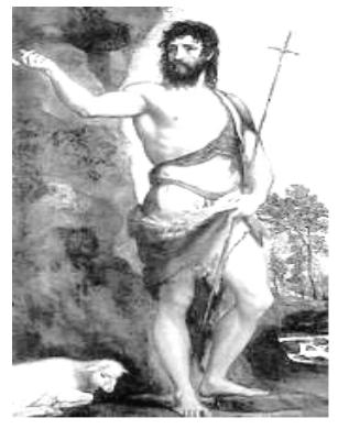
St. John the Baptist Pray for Us