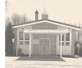
St. John the Baptist Church Port Severn