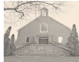
Our Lady of Mercy Church Honey Harbour