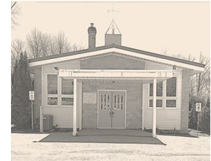
St. John the Baptist Church Port Severn