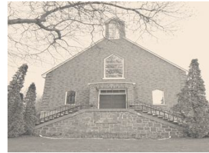
Our Lady of Mercy Church Honey Harbour