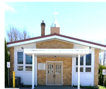
St. John the Baptist Church Port Severn