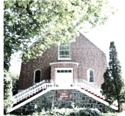
Our Lady of Mercy Church Honey Harbour