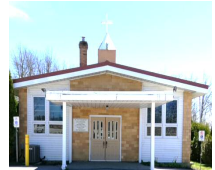
St. John the Baptist Church Port Severn