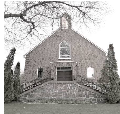
Our Lady of Mercy Church Honey Harbour