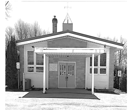
St. John the Baptist Church Port Severn