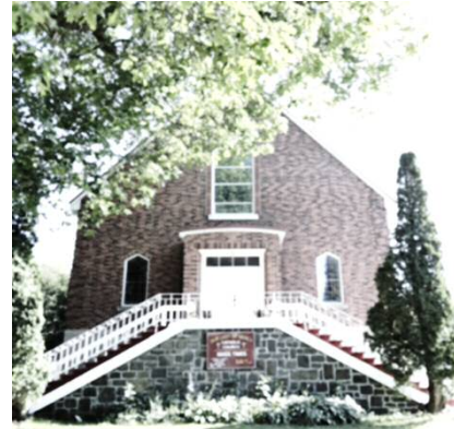
Our Lady of Mercy Church Honey Harbour