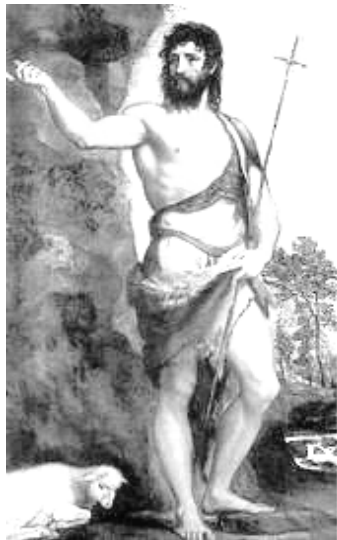
St. John the Baptist Pray for Us