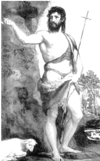
St. John the Baptist Pray for Us