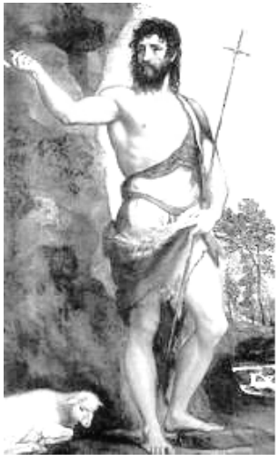
St. John the Baptist Pray for Us