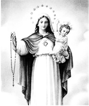
Our Lady of Mercy Pray for Us