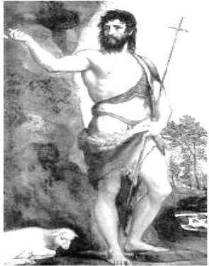
St. John the Baptist Pray for Us