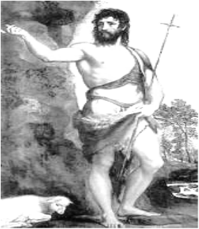
St. John the Baptist Pray for Us