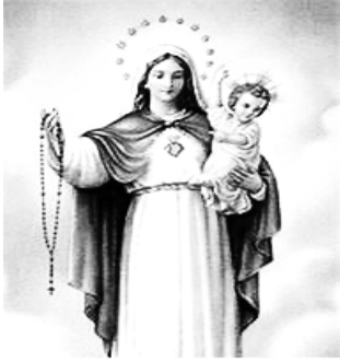
Our Lady of Mercy Pray for Us