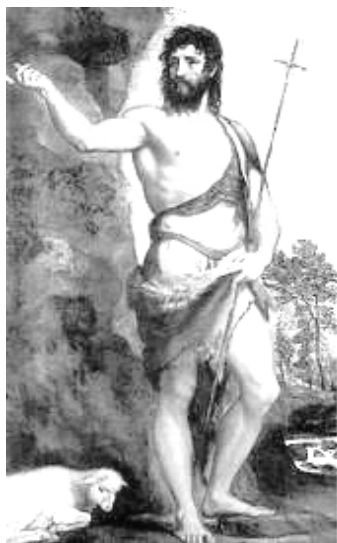
St. John the Baptist Pray for Us