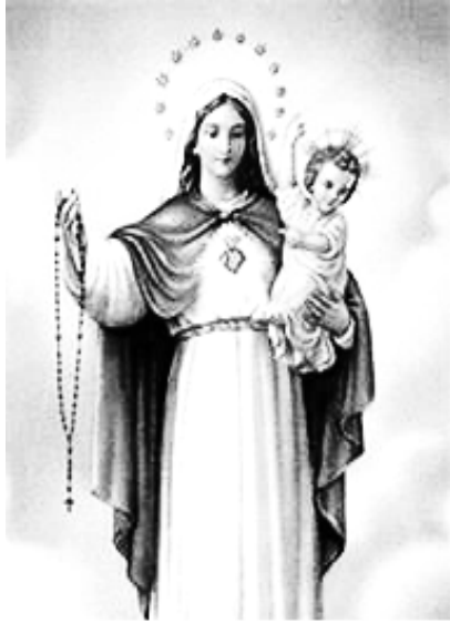
Our Lady of Mercy Pray for Us