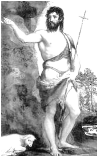
St. John the Baptist Pray for Us