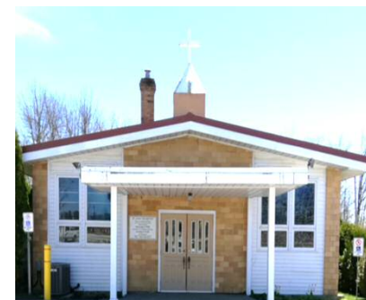
St. John the Baptist Church Port Severn