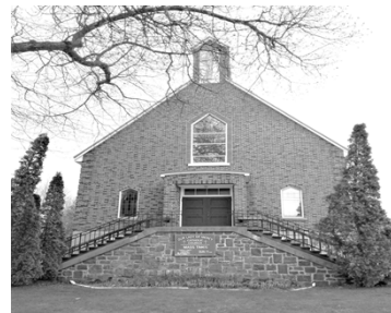
Our Lady of Mercy Church