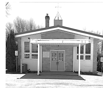
St. John the Baptist Church