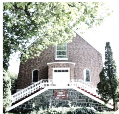
Our Lady of Mercy Church Honey Harbour