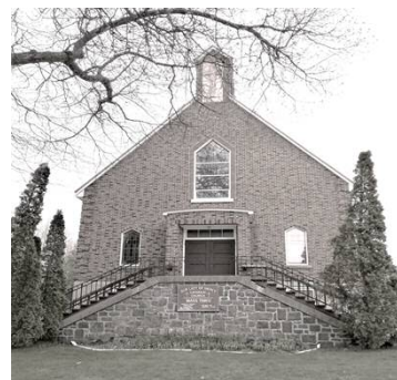
Our Lady of Mercy Church