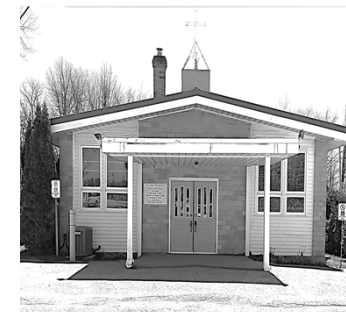
St. John the Baptist Church

Our Lady of Mercy Parish P.O. Box 126 2596 Honey Harbour Rd. Honey Harbour, On P0E1E0 and St. John the Baptist Church 35 Port Severn Rd., Port Severn