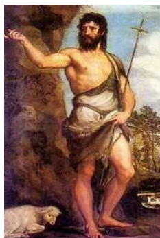
St. John the Baptist Pray for Us