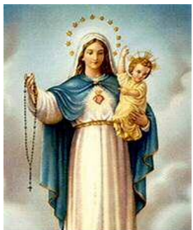
Our Lady of Mercy Pray for Us

"You are Peter, and on this rock I will build my Church."