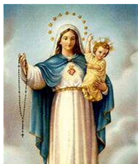
Our Lady of Mercy Pray for Us