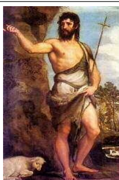
St. John the Baptist Pray for Us

"Love God; love your neighbour. Of these 2 commandments hang all the Law and the Prophets"