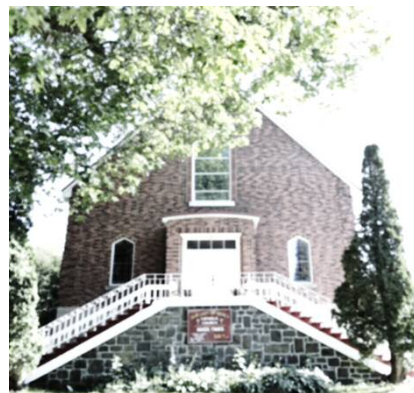
Our Lady of Mercy Church Honey Harbour