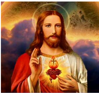
Lord Jesus, Have Mercy On Us

11am @ Honey Harbour – For People of the parish