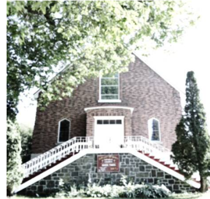
Our Lady of Mercy Church Honey Harbour