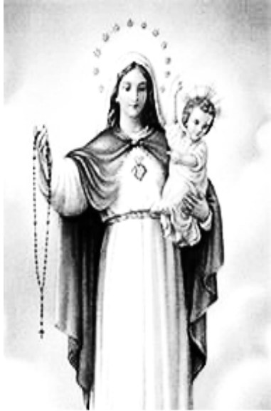
Our Lady of Mercy Pray for Us