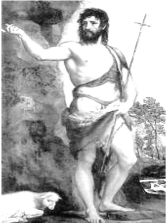
St. John the Baptist Pray for Us